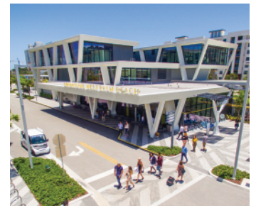
West Palm Beach